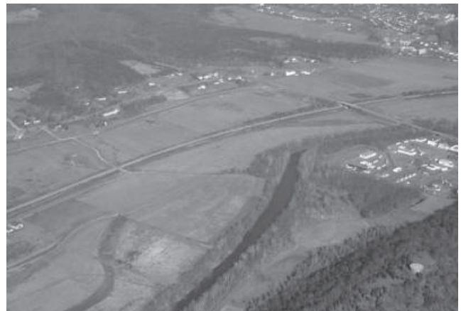
Figure 1: Aerial photograph showing the Upper Potomac River valley in Western Maryland. The Barton Site lies within the field at the centre of the photo between the railway line and the river.

The North Branch of the Potomac River valley contains a wealth of information on the entire span of western Maryland prehistory (see Wright 1963; Wall and Curry 1992; Wall 2001, 2004). To date, the majority of investigations have focused on the area around the Barton site (18AG3), a multi-component prehistoric and Contact period site that has been the focus of Towson University archaeological field schools since 1993. The Barton complex is comprised of a cluster of archaeological sites situated on two river terraces on the Potomac River's North Branch. The site complex spans a 12,000 year time frame from Paleoindian (Clovis) to early Historic times, i.e. the period of initial European contact with inhabitants of the region. Evidence of the latter