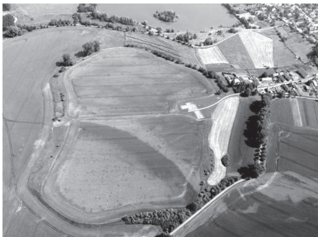
Figure 2: Aerial prospection of the Libice stronghold with evidence of intensive settlement (Gojda 2007).