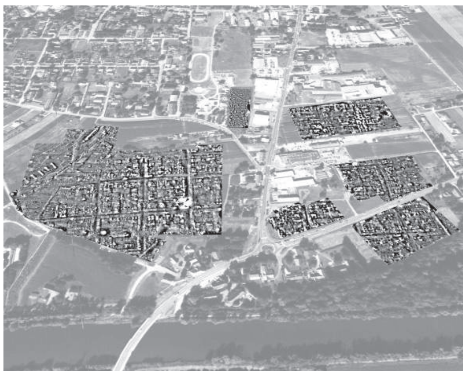
Figure 2: The visualisation of the magnetic prospection of the roman town Flavia Solva overlays the aerial photo of the modern town Wagna. In total 138.400 m 2 were prospected by Archeo Prospections® using a multisensor caesium-gradiometer.