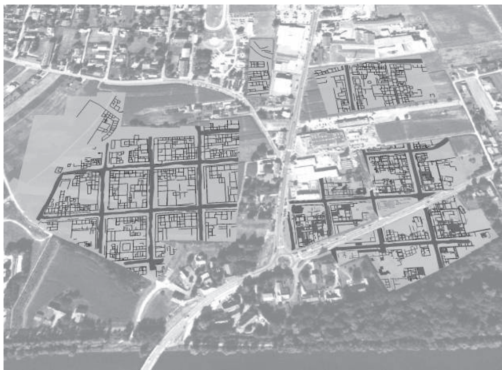
Figure 3: Archaeological Interpretation map of the combined interpretation of the magnetic and GPR Prospection overlays the aerial photo of the modern town Wagna.

ther to the east some large halls which could have been used as storehouses connected to a possible port at the Mur river. In the northeastern part of the municipal area a downright huge villa urbana with a central peristyle court including water basins has been found. Out of the combined interpretation with the magnetic survey data former rooms with hypocausts could be distinguished with high probability.