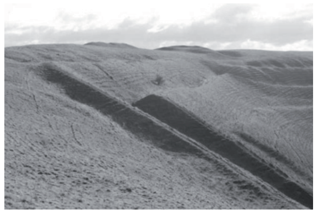
Figure 2: The western ramparts of Hambledon Hill which survive up to 15m high in places, looking south) ©R.Bennett.

The poster will present some methods and results from the initial year of the project along with directions for future research.