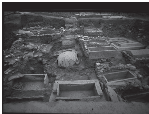
Figure 3: Excavated part of the necropolis area.