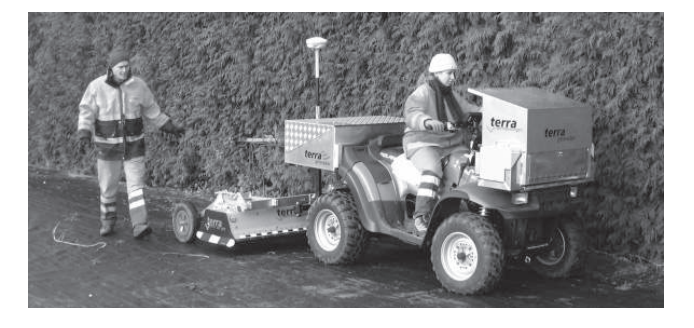
Figure 1: Mounting of the used stepped-frequency GPR array on a Quad bike.

val in frequency domain is more efficient and preserves the reflections much better. There is also a different time delay of the first reflection for each antenna element. Additionally the emission point of the signal varies with frequency (personal communication Egil Eide). Hence the correction of the time delay should be frequency dependent and applied after the background removal, but still in frequency domain. The background removal eliminates also the first reflection because without this process nothing can be seen. Therefore it is very difficult to determine time zero and use any routine to adjust for it. Unfortunately the differences of the