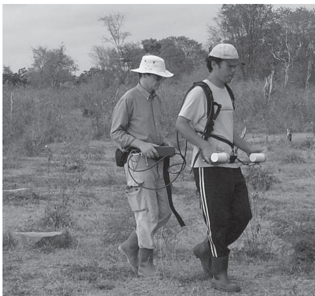
Figure 1: Geometrics G-858 in dual-sensor configuration with two operators.

sensors (heading errors) resulted in striped data. It was hence necessary to balance and align the instrument frequently, at least every two grids. This facilitated the collection of consistent data with low noise levels that allowed to discern archaeological features against a geological background. A relatively high spatial resolution ( 0.25 \text{ m} \times 0.5 \text{ m} ) was essential to identify archaeological anomalies.