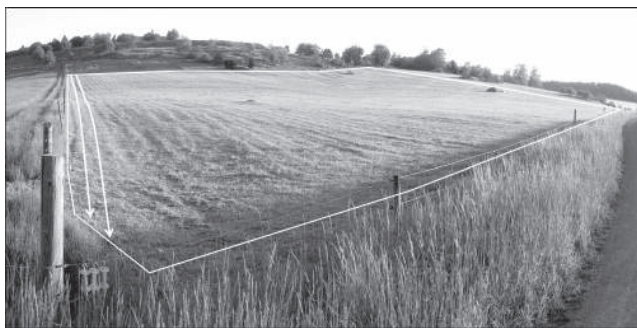
Figure 2 View of the survey area. The extent of the GPR survey area covering three hectares is marked with a white line. The first two MIRA survey tracks are indicated with arrows.

Within 5 hours we recorded 56 survey swaths covering 150 m by 62 m with an in-line and cross-line trace spacing of 8 cm, corresponding to 134.4 line kilometres. Two surveyors using a manually operated single antenna with 25 cm cross-line and 5 cm in-line trace spacing would, in comparison, cover an area of 50 m by 50 m within the same time (in total 10 line km).