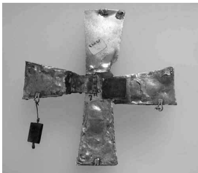
Figure 3a, b: (See colour plate) The cross MAC 25093 from the Torredonjimeno Treasure, made up of at least two different fragmented objects (a), and the arrangement as seen from the back (b) (Photograph by Archivo Au , O. García-Vuelta).

Figure 3a, b : (Voir planche couleur) La croix MAC 25093 du trésor de Torredonjimeno, constituée de fragments d'au moins deux objets différents (a), et leur disposition à l'arrière (b). (Photographie par l'Archivo Au, O. García-Vuelta).