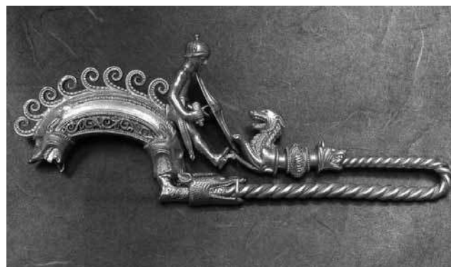
Figure 4: (See colour plate) The Braganza Brooch (The British Museum.).

This fibula, 14 cm long, made in gold and enamel, has a long history behind it, not just because it dates to a period around the 4 th -3 rd century BC, but also because of its bizarre contemporary history, once being in the possession of the Portuguese Royal House of Braganza at some point in the 19 th century. But that is another story, for which there is no space in the present paper. The period that concerns us begins in 2001, when the British Museum purchased this jewel in the Christie auction of 25 April. Although perhaps it is better to begin the story around 1956, when one of its for-