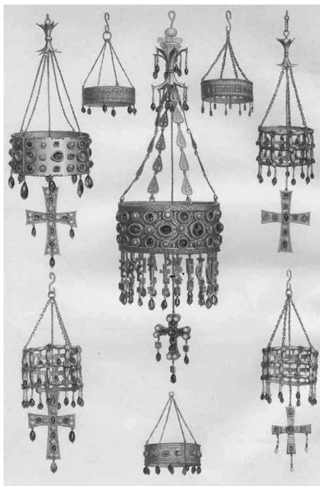
Figure 2: (See colour plate) 19 th century illustration of the Guarrazar Treasure (de Lasteyrie du Saillant, 1860).

The Guarrazar treasure has been divided and is currently on display in various museums in Madrid and Paris, which adds to the difficulty of examining a valuable and unique material. Nevertheless, the assemblage has been studied in a systematic and interdisciplinary way. The entire collection, consisting of ten crowns and eight crosses (Fig. 2), was analysed using PIXE, since we thought this effort was justified in view of our lack of knowledge of the processes of Visigoth manufacture and raw materials. At that time, there was no particle accelerator with an external beam in Spain, so we had to obtain European funding for this project. With the help of two COST Actions, in 1997 and 1999, we gained access first to the LARN ( Laboratoire d'Analyses par Réactions Nucleaires ) in Namur (Belgium), to analyse a series of samples that had been taken from the part of the treasure kept in the Museo Arqueológico Nacional , Madrid, and second, to the AGLAE accelerator of the Centre de Recherche et de Restauration des Musées de France , in the Louvre complex, where all the pieces kept in the Musée Nationale du Moyen Âge de Cluny (Paris) were analysed using PIXE and PIGE techniques. An inter-