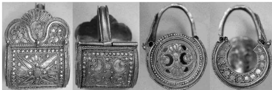
Figure 5 : (Voir planche couleur) Boucles d’oreille “ a bauletto ”, VI e siècle avant J.-C., Cerveteri (Rome, Italie). Les éléments modernes sont mis en évidence en rouge et les anciens en vert.