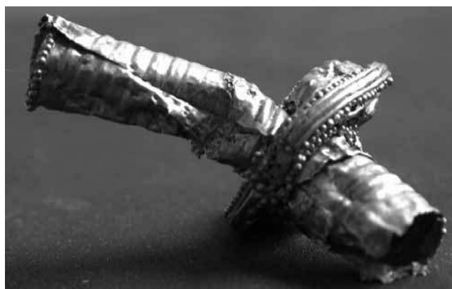
Figure 2: Attachment of the Etruscan hoop earring, 4 th century BC, Adria (Rovigo, Italy).

Figure 2 : Boucle d'oreille étrusque, IV e siècle avant J.-C., Adria (Rovigo, Italie).