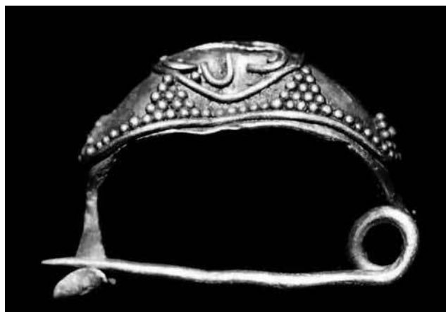
Figure 1: Etruscan fibula, 8 th century BC, Tarquinia (Viterbo, Italy).

Concerning the study of the fibula (Fig. 1) found in an archaeological excavation in Tarquinia (Rome) and dated to the 8 th century BC (presenting some details not pertinent to traditional Etruscan jewellery), the scope of the scientific investigation was the characterization of decorative elements, granulation and filigree, through their geometrical and compositional parameters and their comparison with homologous decorations from the Mediterranean area. In a previous work (Ferro et al. , 2005), a comparison of objective elements present among different technologies employed in the creation of some jewels originating from different geographical areas (Iran, Cerveteri, Adria, Syria) in the temporal range 21 st century BC-3 rd century AD, was carried out.