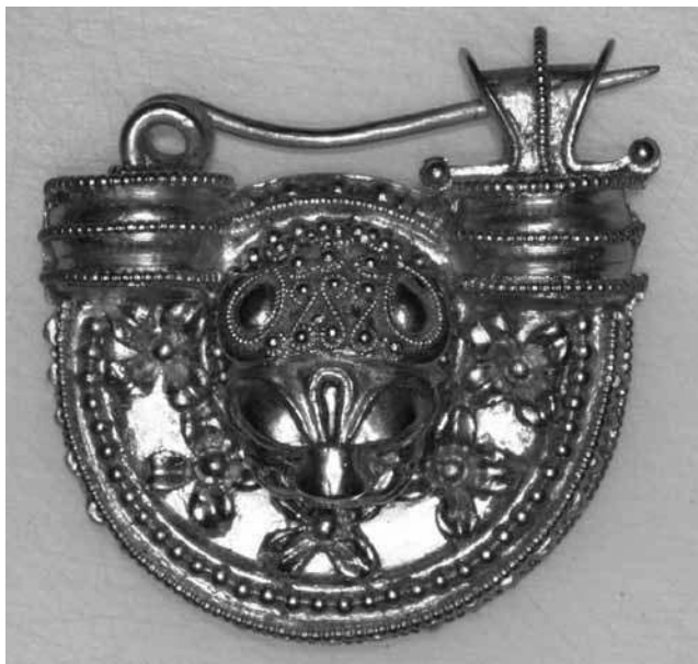
Figure 3: Fibulae decorated with a combination of lion heads and falcon heads embedded in a flower (Selçuk, inv. no. 1/43/94).

Instrument XRF II (Fig. 5), used for investigations in the Ephesus Museum in Selçuk, is equipped with a Rhodium (Rh) X-ray tube (Oxford XTF5011), a silicon drift detector (Röntec XFlash 1000), and a positioning system consisting of two laser beams (Desnica, 2005; Desnica and Schreiner, 2006). The diameter of the primary beam is approximately