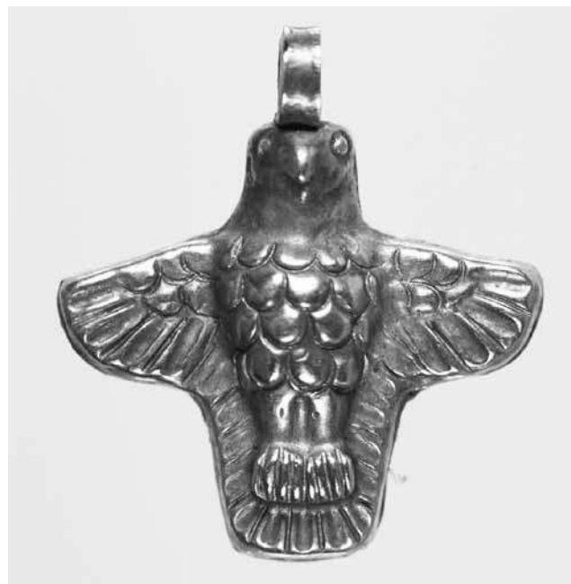
Figure 2: (See colour plate) Bird of prey (Istanbul, inv. no. 3093).

Most of the motifs or figurines refer to Artemis as the goddess of fertility, or her representation as the mistress of animals. For example, the bird of prey (Istanbul, inv. no. 3093, Fig. 2) is considered to be sacred to the goddess, and