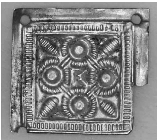
Figure 1: (See colour plate) Appliqué from the sanctuary of Artemis (Selçuk, inv. no. 1/71/89).

Among the gold finds, approximately 530 appliqués were found in the sanctuary of Artemis, representing at the same time the major group of artefacts (Pülz and Bühler, 2006). Most of them show holes on the edges and can therefore be addressed as garment decorations (e.g. Selçuk, inv. no. 1/71/89, Fig. 1). Because of the lack of parallels which would point to individual appliqués votive offerings in the Artemision, an interpretation of these objects as representing decorations of the cult image (Romano, 1988) or ritual garment offerings seems likely.