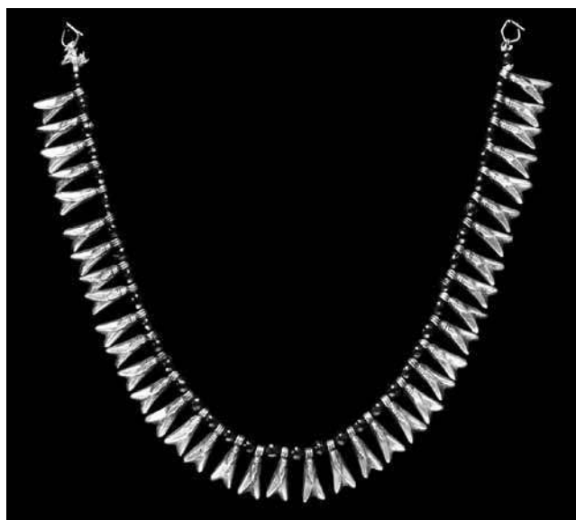
Figure 3: (See colour plate) Garnet and gold necklace with fly amulets, purporting to be New Kingdom period, Egypt. Figure 3 : (Voir planche couleur) Collier de grenats et or avec des amulettes en forme de mouche, attribué au Nouvel Empire, Égypte.

gold work, with circa 75% gold, 20% silver and 5% copper, but it could equally be described as a modern 18 carat alloy. The 'wear' on the gold is unusually coarse, but it is the manufacturing technique used to make the amulets that is most unusual. Large, cast amulets of Egyptian deities do exist, but sets of small identical pendants such as those on this necklace are usually made of foil and are hollow. In addition, those which are undoubtedly of ancient manufacture are mostly threaded via holes through the body or head of the fly, whereas these have a suspension ring at the top. Lilyquist's study of Egyptian fly amulets identified some examples of modern manufacture, though none of them was cast (Lilyquist, 2003). It is possible that well-provenanced examples of cast solid-gold fly pendants will be excavated in the future and vindicate this piece, but until then its authenticity remains very much in doubt.