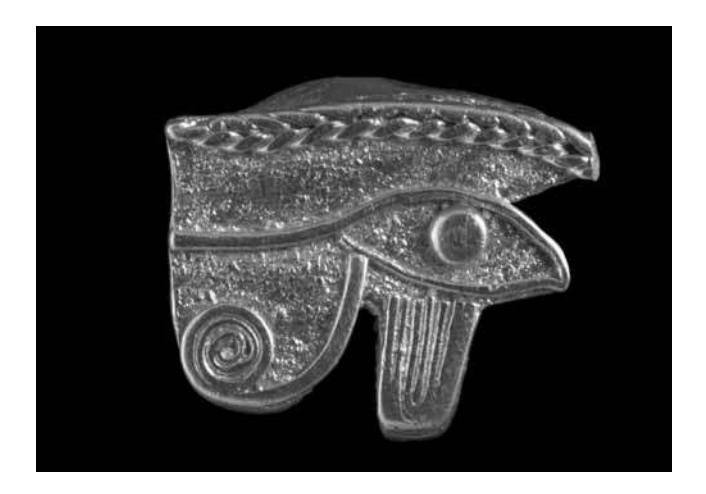
Figure 2: Gold eye of Horus (Wedjat). Figure 2 : Œil d'Horus (Oudjat).

An object that is very interesting from a technological point of view is a gold eye of Horus ( Wedjat ) found in Heracleion (Fig. 2). This bead, hollow inside, is made of two gold blades and a strip of gold sheet used for the sides (Stolz, 2006). We can put forth a hypothesis regarding the technique used to make the pupil, using a flat sphere, filigree and granulation for the decoration. This object is really small, measures 8 mm and weighs 0.4 g; it is less than 2 mm thick. It makes us wonder how the ancient craftsmen were able to weld all those small pieces together, and to produce such tiny details. Usually, this type of jewellery is embossed or moulded, and it is quite unusual to identify the use of filigree and granulation, indicating the intricate work involved in the production of such a small object.